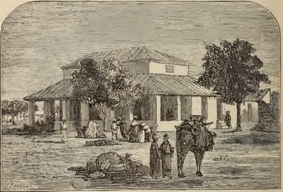
TRAVELER'S BUNGALOW, INDIA.